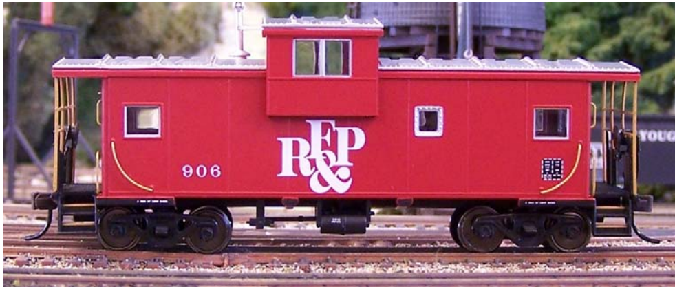
ATLAS HO WIDE-VISION CABOOSE IN RED (RF&P Historical Society Exclusive)

This catalog's specials available from the RF&P Historical Society Company Store: