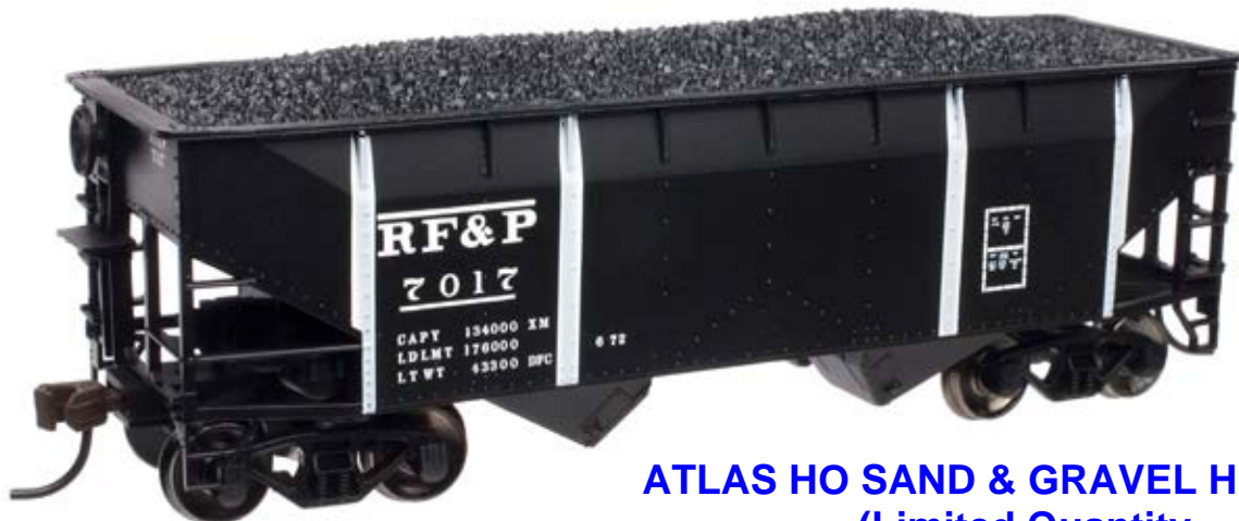
ATLAS HO SAND & GRAVEL HOPPERS (Limited Quantity)